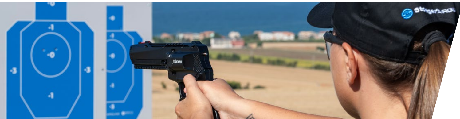
Ergonomic Hand Grip Thridion checkering for improved grip and handling