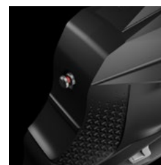
Pressure Indicator Pin (PIP)