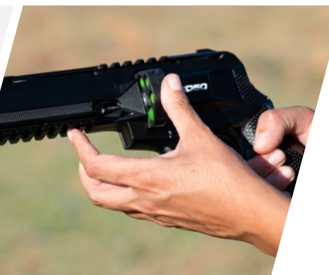
CO2 Chamber Cap* CO2 cartridge chambers are concealed by an innovative cap from Stoeger Airguns, enhancing the handgun's aggressiveness and realism