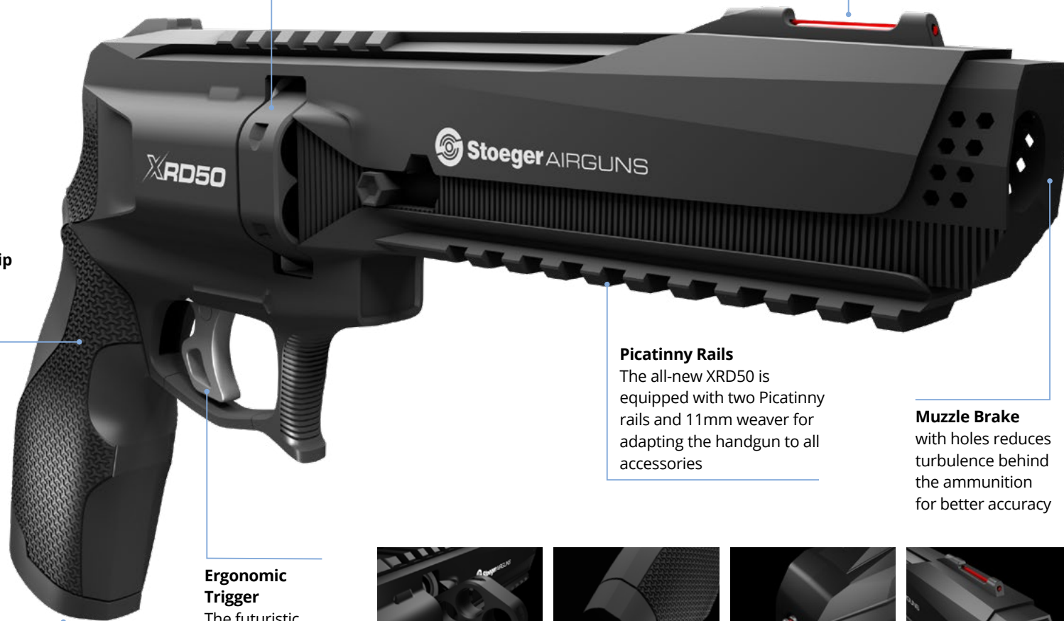
Picatinny Rails The all-new XRD50 is equipped with two Picatinny rails and 11mm weaver for adapting the handgun to all accessories