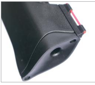
An interchangeable raised fibre optic foresight bar sits on top of the very efficient S3 Suppressor

Thanks to T & J. J McAvoy LTD for supplying rifle on test